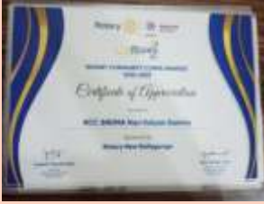
CERTIFICATE OF APPRECIATION RCC SNDMA NARI KALYAN SAMITY