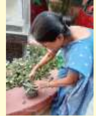
RCC SNDMA Nari Kalyan Samity