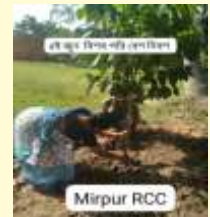
RCC Mirpur Rural Centre