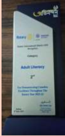
2ND PRIZE ADULT LITERACY RCC SNDMA NARI KALYAN SAMITY