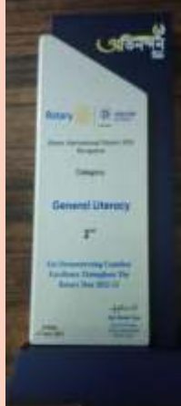
2ND PRIZE GENERAL LITERACY RCC SNDMA NARI KALYAN SAMITY