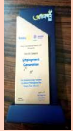
3RD PRIZE EMPLOYMENT GENERATION RCC BANTRA ANATHBANDHU SAMITY