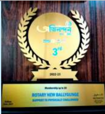
3RD PRIZE SUPPORT TO PHYSICALLY CHALLENGED