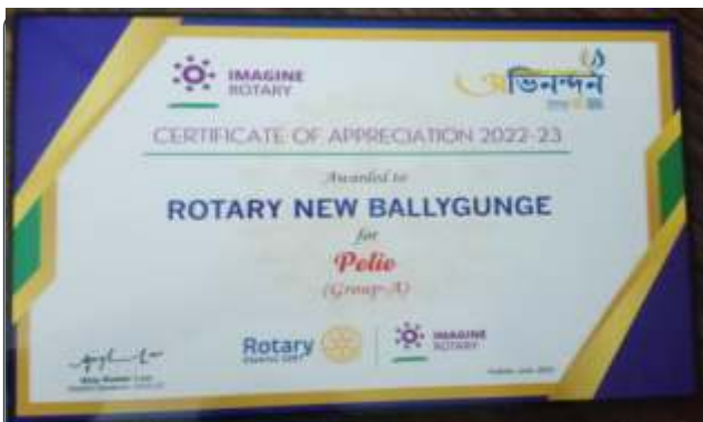
CERTIFICATE OF APPRECIATION POLIO