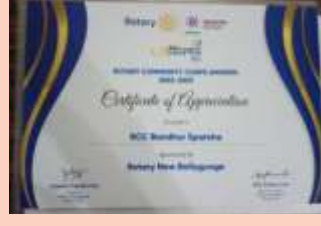
CERTIFICATE OF APPRECIATION RCC BANDHUR SPARSHA