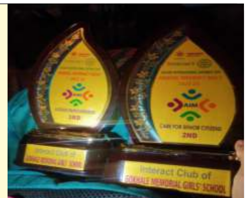
2ND PRIZE – CARE FOR SENIOR CITIZEN 3RD PRIZE - WOMAN EMPOWERMENT