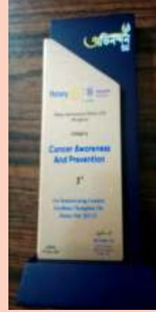
3RD PRIZE CANCER AWARENESS & PREVENTION RCC BANDHUR SPARSHA