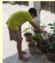
RCC Bantra Ananthbandu