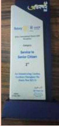
2ND PRIZE SERVICE TO SENIOR CITIZEN RCC SNDMA NARI KALYAN SAMITY