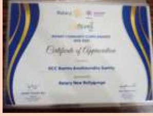
CERTIFICATE OF APPRECIATION RCC BANTRA ANATHBANDHU SAMITY