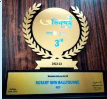
3RD PRIZE RCC