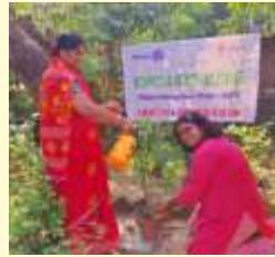
Club Secretary planting trees